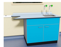
Sit on bowl on sink unit