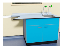
Sit on bowl on sink unit