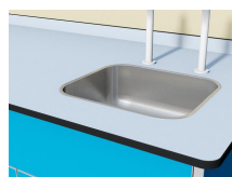
Sit on bowl on sink unit