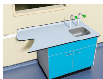
Sit on bowl on sink unit