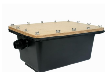
Vulcathene Clay trap