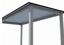
Modular scientific Mobile table