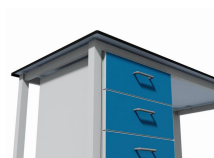
Mobile table with unit