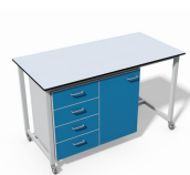
Mobile table with units