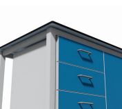
Mobile table with units