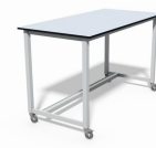
Modular scientific Mobile table