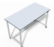
Modular scientific Mobile table