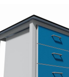
Mobile table with units