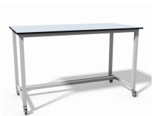
Modular scientific Mobile table

Each table is able to support up to 3 modular storage units. The modular storage units can be purchased at the same time or they can be easily installed into an existing Kinetic Laboratories modular mobile table at a later date.