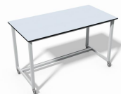
Modular scientific Mobile table