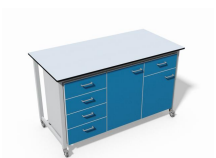
Mobile table with units