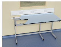
C frame laboratory support system with Trespa Toplab base worktop