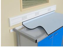
Laboratory mobile units in C frame laboratory support system with Trespa Toplab base worktop