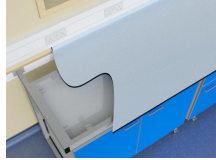
Laboratory mobile units in C frame laboratory support system with Trespa Toplab base worktop