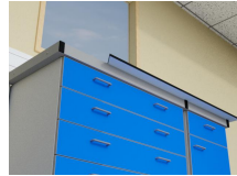
Laboratory suspended units in C frame laboratory support system with Trespa Toplab base worktop