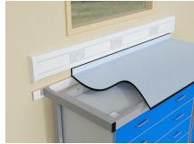
Laboratory suspended units in C frame laboratory support system with Trespa Toplab base worktop