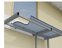
C frame laboratory support system with Trespa Toplab base worktop