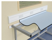
C frame laboratory support system with Trespa Toplab base worktop