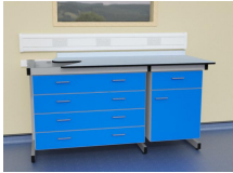
Laboratory suspended units in C frame laboratory support system with Trespa Toplab base worktop