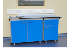
Laboratory mobile units in C frame laboratory support system with Trespa Toplab base worktop