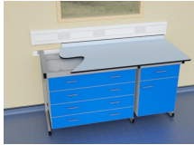
Laboratory suspended units in C frame laboratory support system with Trespa Toplab base worktop