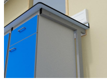
Laboratory mobile units in C frame laboratory support system with Trespa Toplab base worktop