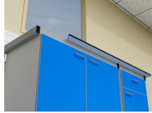
Laboratory mobile units in C frame laboratory support system with Trespa Toplab base worktop