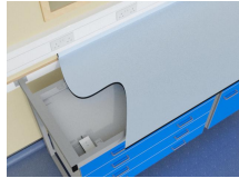
Laboratory suspended units in C frame laboratory support system with Trespa Toplab base worktop