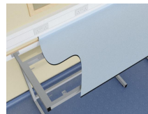
C frame laboratory support system with Trespa Toplab base worktop