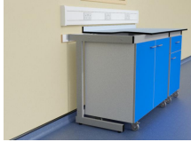
Laboratory mobile units in C frame laboratory support system with Trespa Toplab base worktop