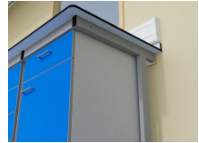
Laboratory suspended units in C frame laboratory support system with Trespa Toplab base worktop