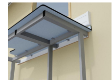
C frame laboratory support system with Trespa Toplab base worktop