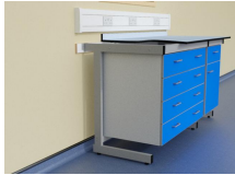
Laboratory suspended units in C frame laboratory support system with Trespa Toplab base worktop