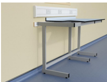
C frame laboratory support system with Trespa Toplab base worktop

The laboratory steel frames are epoxy powder coated and available in a range of colours.