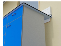
Laboratory pedestal units with Trespa Toplab base worktop