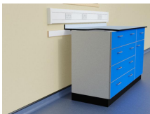
Laboratory pedestal units with Trespa Toplab base worktop

The Pedestal laboratory support system is available in a range of colours.