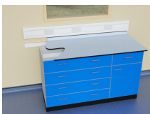
Laboratory pedestal units with Trespa Toplab base worktop