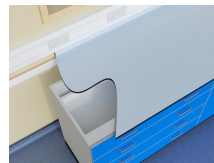
Laboratory pedestal units with Trespa Toplab base worktop