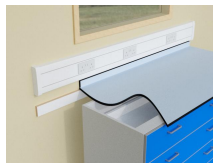
Laboratory pedestal units with Trespa Toplab base worktop