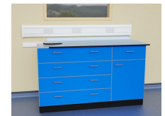
Laboratory pedestal units with Trespa Toplab base worktop