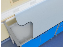
Laboratory mobile units in T frame laboratory support system with Trespa Toplab base worktop