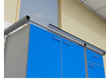
Laboratory mobile units in T frame laboratory support system with Trespa Toplab base worktop