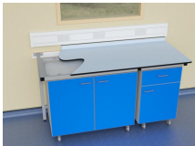
Laboratory mobile units in T frame laboratory support system with Trespa Toplab base worktop