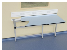
T Frame laboratory support system with Trespa Toplab base worktop