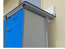
Laboratory mobile units in T frame laboratory support system with Trespa Toplab base worktop