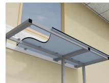
T Frame laboratory support system with Trespa Toplab base worktop