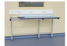
T Frame laboratory support system with Trespa Toplab base worktop