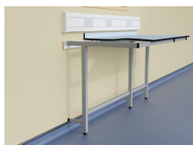
T Frame laboratory support system with Trespa Toplab base worktop

The laboratory steel frames are epoxy powder coated and available in a range of colours.