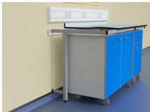
Laboratory mobile units in T frame laboratory support system with Trespa Toplab base worktop