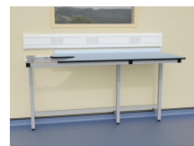
T Frame laboratory support system with Trespa Toplab base worktop