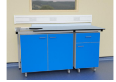
Laboratory mobile units in T frame laboratory support system with Trespa Toplab base worktop