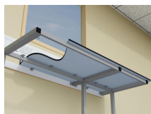
T Frame laboratory support system with Trespa Toplab base worktop