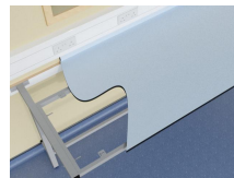
T Frame laboratory support system with Trespa Toplab base worktop