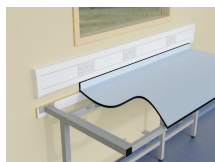
T Frame laboratory support system with Trespa Toplab base worktop