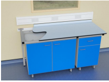
Laboratory mobile units in T frame laboratory support system with Trespa Toplab base worktop