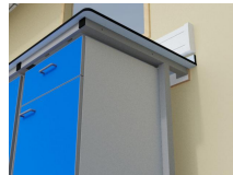
Laboratory mobile units in T frame laboratory support system with Trespa Toplab base worktop