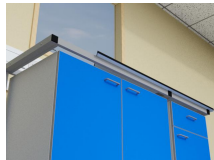
Laboratory mobile units in T frame laboratory support system with Trespa Toplab base worktop