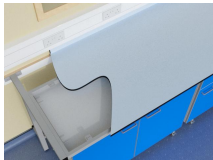
Laboratory mobile units in T frame laboratory support system with Trespa Toplab base worktop