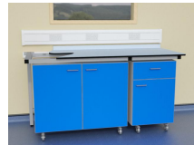
Laboratory mobile units in T frame laboratory support system with Trespa Toplab base worktop