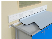
Laboratory mobile units in T frame laboratory support system with Trespa Toplab base worktop