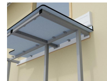
T Frame laboratory support system with Trespa Toplab base worktop