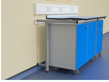
Laboratory mobile units in T frame laboratory support system with Trespa Toplab base worktop