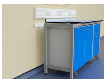
Mobile units in A frame support system with Trespa Toplab worktop