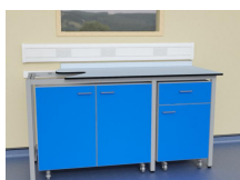
Mobile units in A frame support system with Trespa Toplab worktop