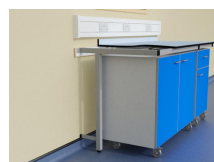
Mobile units in T frame support system with Trespa Toplab worktop