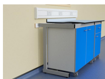
Mobile units in C frame support system with Trespa Toplab worktop