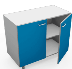
Double 2 door unit

Kinetic laboratory mobile units are fixed on swivel castors allowing them to be transported from one area to another. The laboratory furniture range is available in a bespoke choice of sizes and colours and can accommodate Grathnell trays.