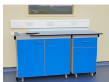
Mobile units in C frame support system with Trespa Toplab worktop