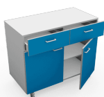
Double 2 door 2 drawer unit