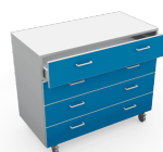
Double 4 drawer unit