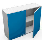
Double 2 door wall unit with solid doors

Kinetic laboratory wall units are fixed onto walls, usually above laboratory workspaces to provide additional laboratory storage. The laboratory furniture range is available in a bespoke choice of sizes, colours and door types.