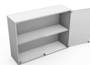
Double 2 door wall unit with glass doors