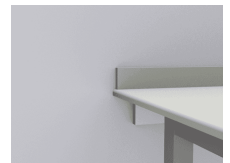
Epoxy worktop with 7mm radiused edge