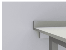
Epoxy worktop with bunded edge