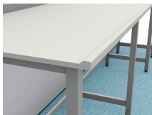
Epoxy worktop with bunded edge