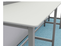
Epoxy worktop with 7mm radiused edge