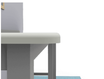
Epoxy worktop with 7mm radiused edge