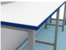
Laminate worktop with 2mm thick ABS lipping

Laminate is an affordable alternative to solid surface for laboratory areas that do not require strict cleaning regimes and durability. The range is available in a bespoke choice of sizes and colours.