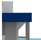
Laminate worktop with 2mm thick ABS lipping