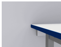
Laminate worktop with 2mm thick ABS lipping