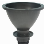
Large circular vulcathene drip cup