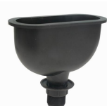
Large oval vulcathene drip cup