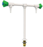
Hot or cold twin inline tap with hand wheels