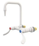
Wall mounted hot & cold mixer tap with wrist action levers & removable nozzle