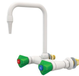
Wall mounted hot & cold mixer tap with hand wheels & removable nozzle