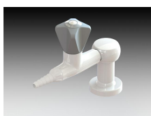
1 way worktop mounted

High Vacuum – 0,001kPa to 0,0000001 kPa (VH)