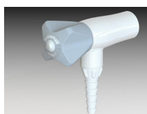
1 way wall mounted