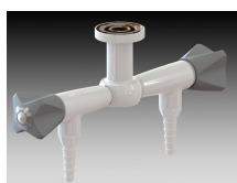
2 way inline reagent mounted