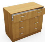
Double 4 drawer unit