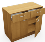
Double 2 door 2 drawer unit