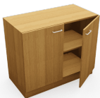
Double 2 door unit

Kinetic free standing units are a self-supporting unit supported on a fixed plinth with encased adjustable feet for levelling. The range is available in a bespoke choice of sizes, colours and can accommodate Gratnell trays.