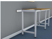
A Frame support system with Beech laminate worktop

Kinetic A Frame support system allows independent worktop support without the use of under bench storage. The span frames and the low level back rails can vary in length and will form a series of individual spaces. Allowing the client the option of adding suspended units, free standing units or mobile units. The storage spaces can also be customised to take clients own equipment such as fridges and freezers or can be left open to provide knee spaces for write-up areas. Steel frame are epoxy powder coated and are available in a range of colours.