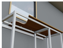
A Frame support system with Beech laminate worktop