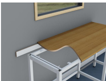
A Frame support system with Beech laminate worktop