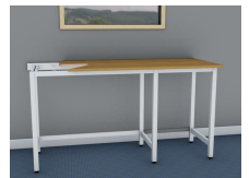
A Frame support system with Beech laminate worktop