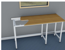
A Frame support system with Beech laminate worktop