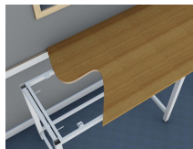
A Frame support system with Beech laminate worktop