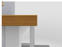
Laminate worktop with 2mm thick ABS lipping