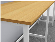
Laminate worktop with 2mm thick ABS lipping

Laminate is an affordable alternative to solid surface for areas that do not require strict cleaning regimes and durability. The range is available in a bespoke choice of sizes and colours.